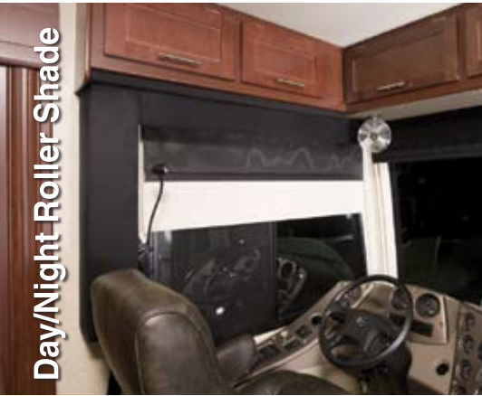
Day/Night Roller Shade