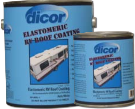
Dicor Elastomeric RV Roof Coating protects and beautifies metal, aluminum,

steel, fiberglass and previously coated RV roofs. Dicor Elastomeric RV Roof Coating is formulated with 100% Acrylic Elastomeric resins to form a rubber like coating that will expand and contract with the roof movement. Arctic White RV Elastomeric is brilliant white to provide a superior reflectivity thereby lowering interior tempera.