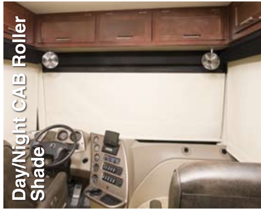
Day/Night CAB Roller Shade