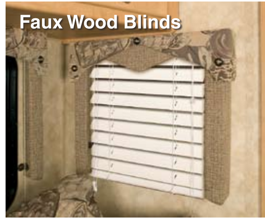
Faux Wood Blinds